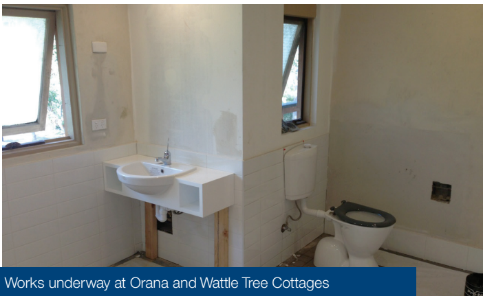
Works underway at Orana and Wattle Tree Cottages