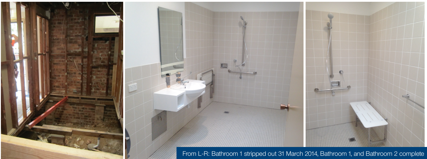
From L-R: Bathroom 1 stripped out 31 March 2014, Bathroom 1, and Bathroom 2 complete

The work carried out could not have been done without the generous support of our Subcontractors and their suppliers