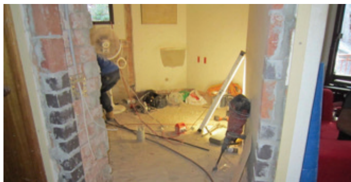
Red Gum Cottage, plumbing rough in happening to bathroom 1

Bathroom 1 was handed over in early May, and the residents are thrilled with the end result. Bathroom 2 works are currently at the waterproofing stage and on target for completion by 30th of May, an impressive three and a half weeks since starting the bathroom!