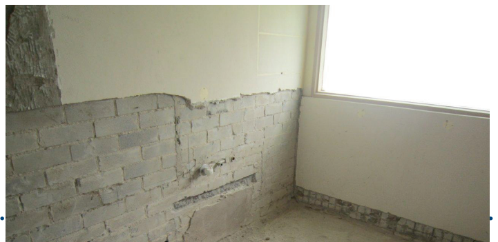
L: Torrs Cottage, Upstairs stripped out. 31 March 2014 R: Orana Cottage, Stripped out waiting for plumbing "rough in". 31 March 2014.